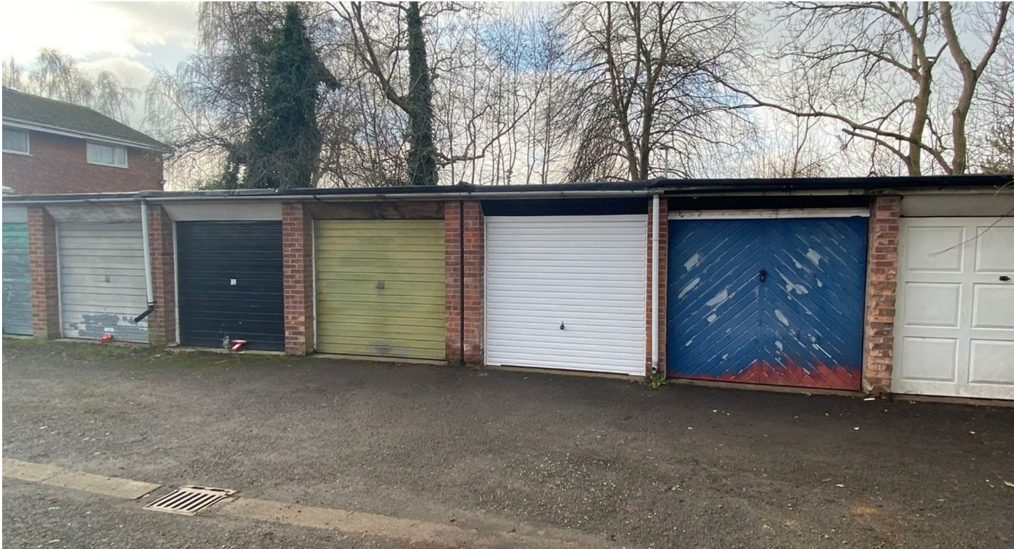
Garage to rear of 80 Berwick Avenue, Heaton Mersey, Stockport, £100 Per Month